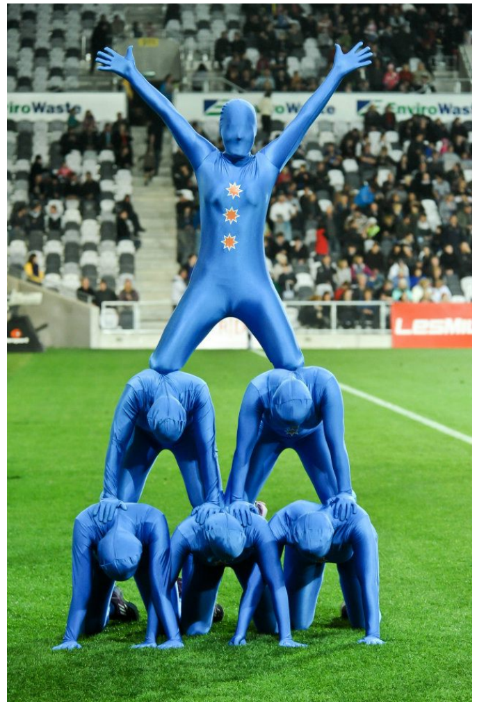
A human pyramid. 8

This is similar to inference in real life: if you flip a switch and a light turns on afterward, you would infer that flipping the switch causes the light to turn on, but you would not infer that that unscrewing the light does anything to the switch.