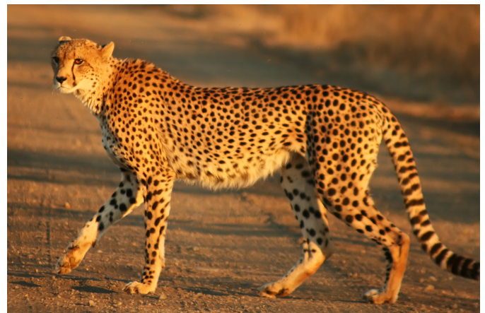
A cheetah. 3

Let’s start with the idea that a neuron might be active when you look at a coffee cup, but not when you look at a cheetah. (Such neural selectivity is occurs, for example, in the primary visual cortex: some neurons turn on in response to bars, while other neurons turn on in response to edges.)