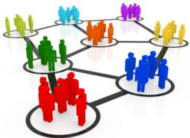
A social network. 1

A network is just a bunch of interconnected things. In social networks, people and social groups are connected through communication. In computer networks (such as the Internet!), computers can transmit data to one another.