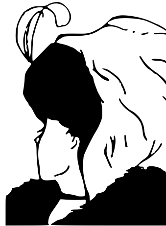
Young woman or old woman? 6

in the optical illusion below as being either young or old, you might have trouble seeing the other perspective.