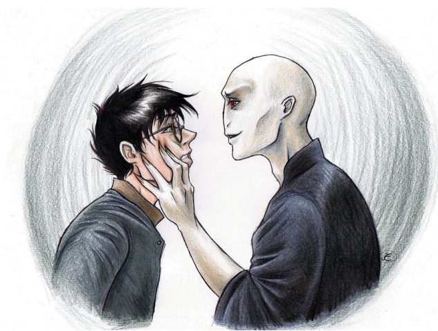
Voldemort is on the right. 9

To see feedback predictions at work, recall the first time you saw Lord Voldemort (if you're not familiar with the Harry Potter series, take a look at the bald person in the picture below).