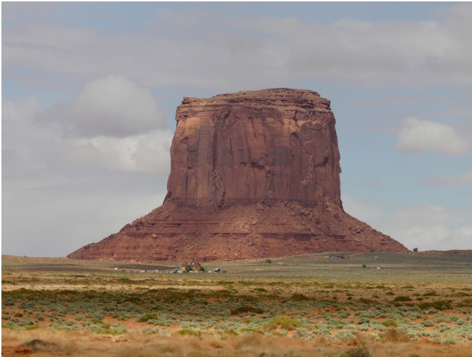
Thresholding: either you're on, or you're not. 7

Neurons use an analogous solution: thresholding . A neuron does not turn on until it receives input that passes a particular level, called a threshold . Once the input is above the threshold, the neuron begins to turn on. This way, losing neurons that receive a slight amount of input remain completely off, since their slight amount of input is below the threshold.