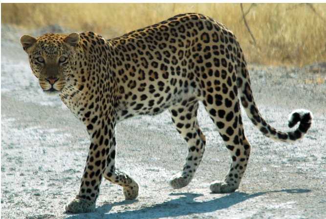
A leopard. 5

However, at a glance, we might be unsure whether we saw a cheetah or a leopard, because cheetahs and leopards share many similar characteristics.