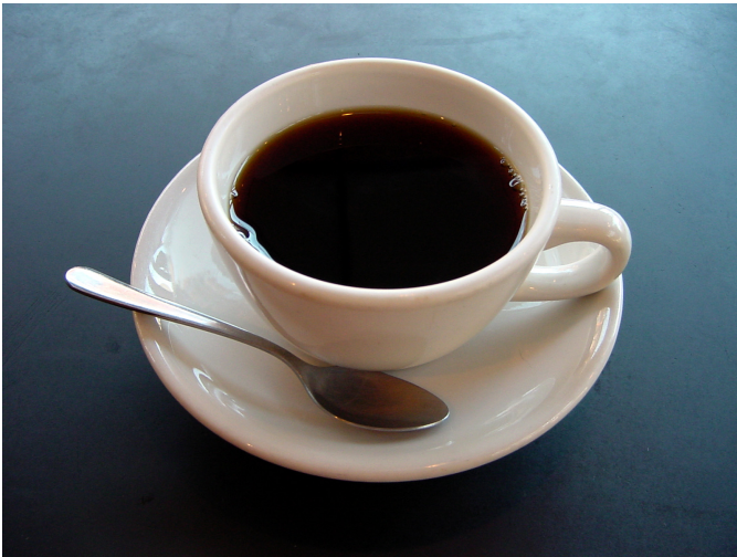
A coffee cup. 4

However, at a glance, we might be unsure whether we saw a cheetah or a leopard, because cheetahs and leopards share many similar characteristics.